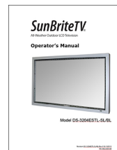
SB-3214EST TV Operator's Manual